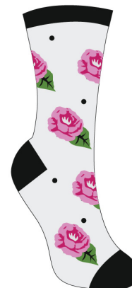
H0004-1 Will You Accept this Rose? (Clear)