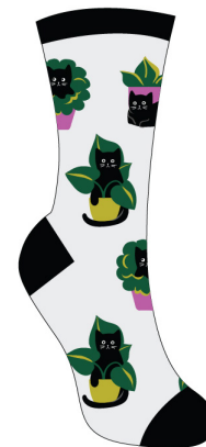
H0010 I Do What I Want