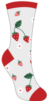
H0002 Berry Cute