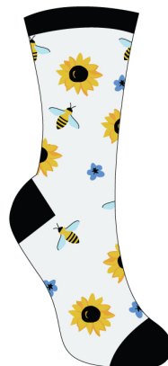
H0003 You Are My Sunshine