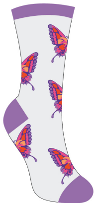
H0001 You are Flutterly Fabulous