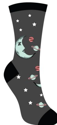
H0012 Once In a Blue Moon