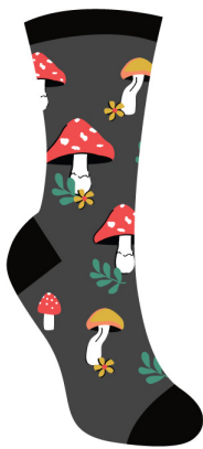
H0011 Made of Magic