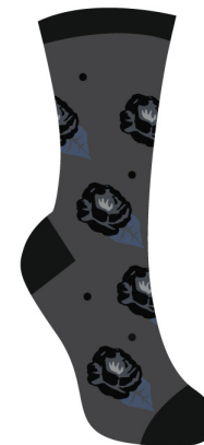
H0004-2 Will You Accept this Rose? (Black)