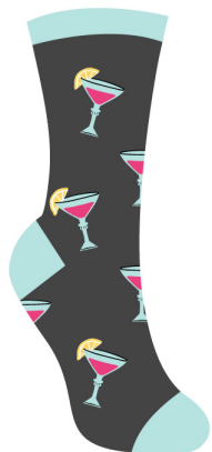
H0006 Just Here for the Cocktails